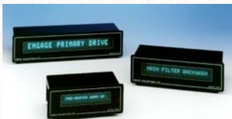
2000 Series Family Photo