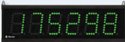
Display total count in green...

Every production situation is unique. That's why XL makes it especially easy to select the metrics that are most meaningful for your plant floor. With 100+ metrics available “out of the box”, XL easily adapts to your needs. Plant floor events are immediately reflected on the XL Visual Display, providing a direct link between action (line goes down) and reaction (operator resolves problem).