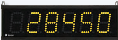
Display run rate in amber...