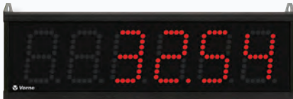
When the line goes down automatically display down time in red.

©2008-2013 Vorne Industries, Inc. All rights reserved. Prices and specifications subject to change without notice. Please reference the Vorne Product Warranty Statement and Sales Terms and Conditions at www.vorne.com . Vorne Industries, Inc. makes no warranties express or implied except as expressly stipulated in our Product Warranty Statement. Free 90-day trial offer is for qualified manufacturing applications only. Vorne, Visual OEE, Productivity Appliance, Data Anywhere, Data Everywhere, and We Improve Manufacturing Productivity are trademarks of Vorne Industries. All other trademarks are the property of their respective owners. REVISION 201303